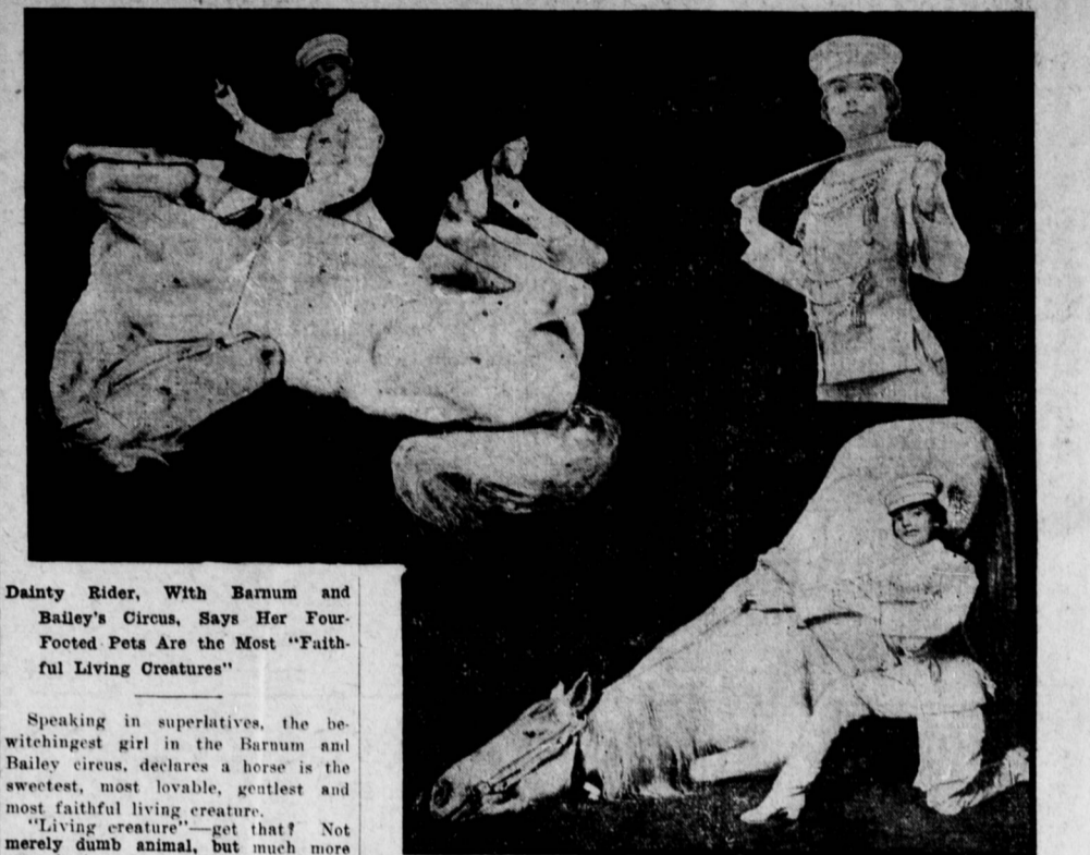
Dainty Rider, With Barnum and Bailey's Circus, Says Her Four-Footed Pets Are the Most "Faithful Living Creatures"

Speaking in superlatives, the bewitching girl in the Barnum and Bailey circus, declares a horse is the sweetest, most lovable, gentlest and most faithful living creature.