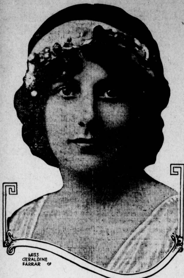
MISS GERADINE FARRAR

Miss Geradine Farrar is going into motion pictures. At a salary said to be more than double that received by the highest paid stars of the "movies" the popular young American prima donna of the Metropolitan Opera Company has signed a contract with the Jesse L. Lasky Feature Play Company to appear in film productions made in its studios at Hollywood, Cal.