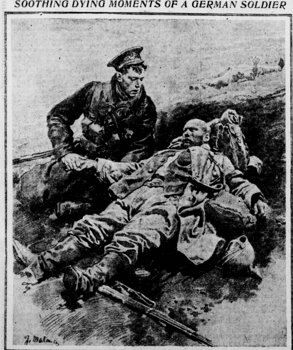
THE FIGHTING SPIRIT OF THE BRITISH " - AN INCIDENT ON THE BATTLEFIELD

Concerning this incident, drawn especially for this newspaper, the New York "Herald" and the London "Sphere," a British soldier at the front in a letter says: "I stopped for a few seconds by the side of a German who was dying. He was in great pain, and when I asked what! could do for him he said in a pathetic tone that went to my heart, 'Nothing unless you would be so good as to hold my hand until all is over.' I gave him my hand and stayed to the end. It seemed to comfort that poor chap a lot. He was able to speak good English, and we had quite a pleasant chat, considering the circumstances."