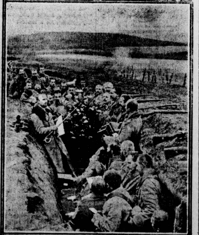
GERMANS SINGING IN THEIR TRENCHES IN EAST PRUSSIA. This scene was photographed in the German trenches, on the banks of the Angerap River, near Darkheim, in East Prussia.