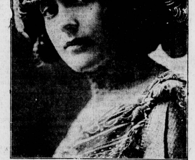
ANNETTE KELLERMAN In Neptune's Daughter at Photoplay To-day.

Send no money, take no risks, make no promises. Simply clip, sign and mail the coupon and the test package of the New Combined Treatment will be sent, fully prepaid, together with the valuable book on Catarrh.