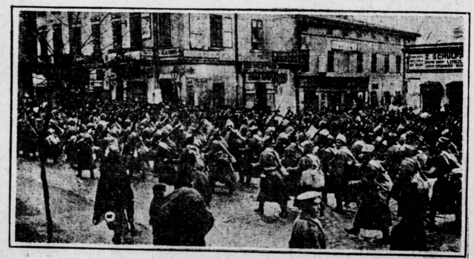
Russian Soldiers on the March Through a Galician Town.