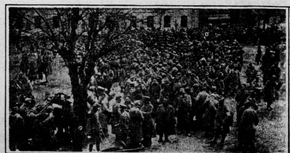
A Group of Austrian Prisoners with Their Russian Captors. The Prisoners Were Captured by the ussians in Their Recent Campaign in Galicia.