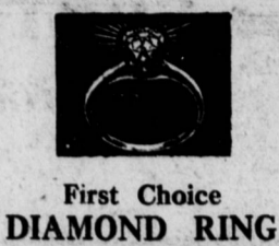
First Choice DIAMOND RING