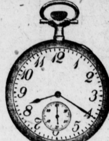
Third Choice GOLD WATCH