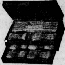
Second Choice CHEST OF SILVER