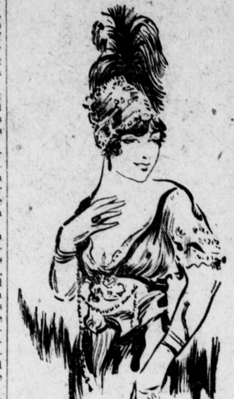
"Everyone Looks at a Face Bearing a Lovely Complexion—it is Nature's Greatest Gift to Woman."

No need for anyone to go about any longer with a face covered with pimples, blotches, eruptions, blackheads and liver spots.