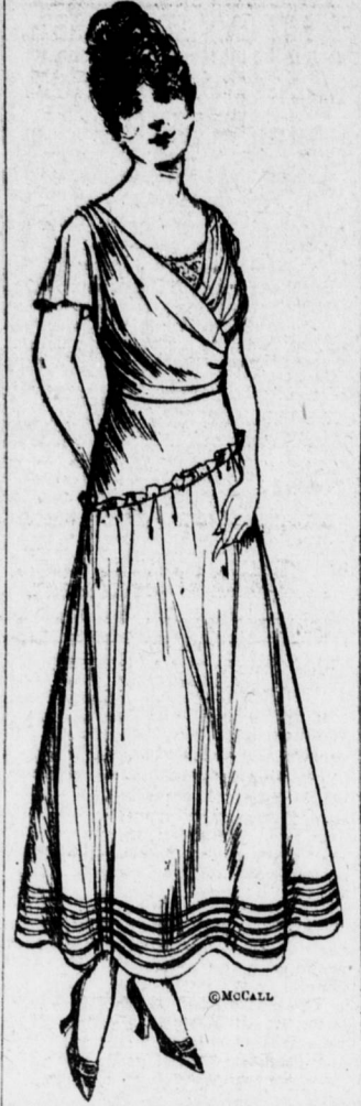
A Simple Evening Frock of Chiffon and Taffeta

New York, Jan. 8. The separate waist is an established custom. Not necessarily the plain or tailored waist, but the dainty, dress affair of net, lace, chiffon, silk, batiste, fine linen or voile.