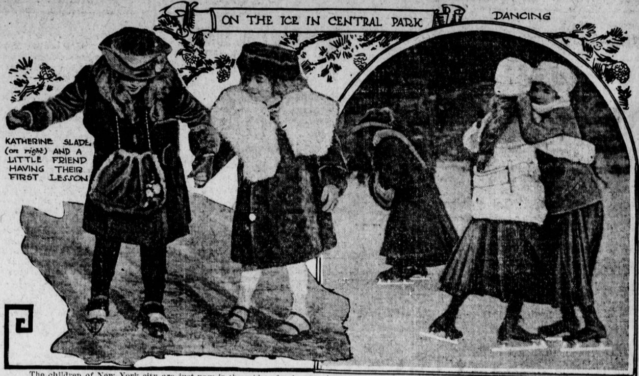
The children of New York city are just now in the midst of a joyous skating season. True, the city child does not enjoy as many advantages as his country cousin when the ice skating period is due, but nevertheless they have their spin on the steel runners when the big lakes in Central Park, Van Cortlandt Park and Prospect Park, in Brooklyn, are frozen over.

"That was a pretty clever dawg. Ab," drawled he, "an' I make no doubt he was just as knowin' as you let on; but, say, he wasn't a marker to a dawg my old man owned. Bays, the devotion of that dawg to the old man was short amazin'. Onct he heard the old man say he was pressin' for money, so he went an' died the day before the dog tax was due!"—St. Louis Post-Dispatch.