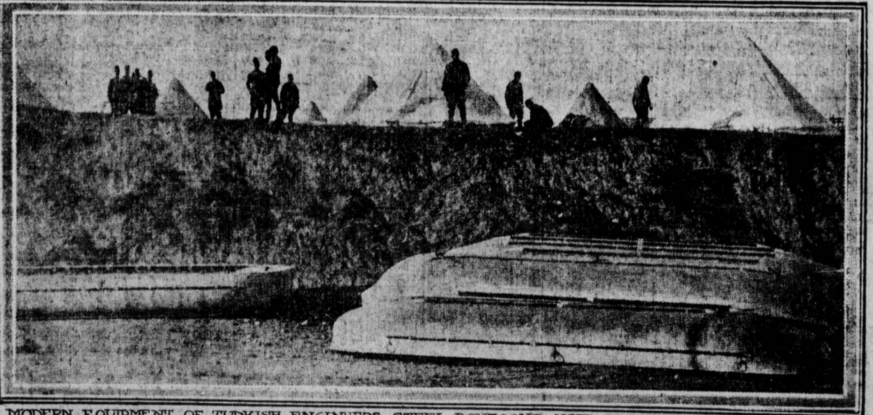
MODERN EQUIPMENT OF TURKISH ENGINEERS, STEEL PONTOONS USED IN BRIDGE BUILDING.