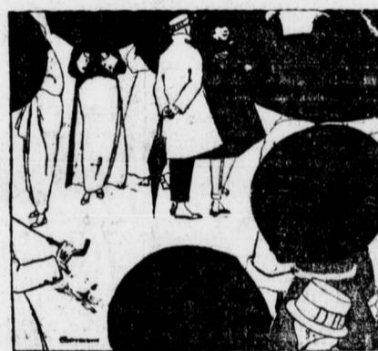
"Umbrellas, umbrellas, way down in the street, Bobbing along through the rain on feet; That's how they look as they pass below; Umbrellas and feet are the most that show."

Every man and woman likes to own at least one "dress" umbrella, so one of the most highly appreciated of all gifts is a gift umbrella.