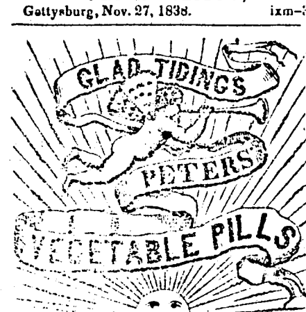
"The True Riches of Life is Health."