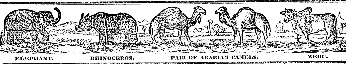
THE UNICORN OR RHINOGRADS WINGHING 6523 POUNDS