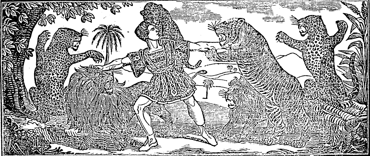
ONE LARGE CAGE ALL CONFINED