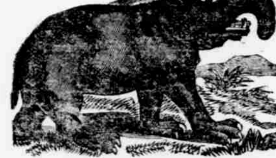
The Wonders of Animated Nature Consolidated with the only LEGITIMATE CIRCUS

Egyptian Caravan, Combined for the Season of 1864, with One Price of Admission.