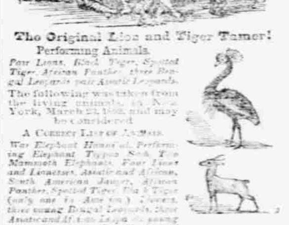
The Original Lion and Tiger Tamer!