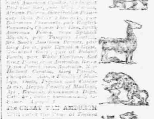
A Curious Litter of Camels.