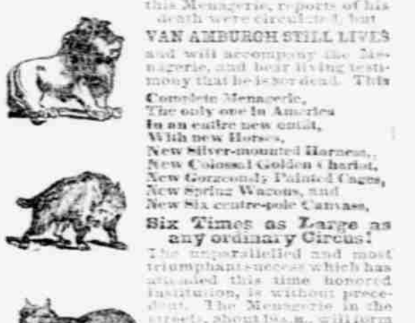
VAN AMBURGH STILL LIVES.