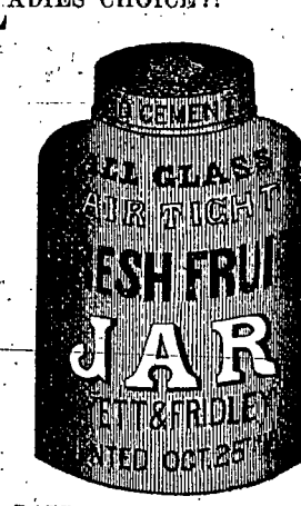
PATENT SELF-TESTING AND SELF SEALING.

ators attached CLOVER HULLERS. STRAW CUTTERS, CORN SI STRAW OUTTERS, &c. Separators from 6 to 8 horse power, built to order. N. B. Irons and material slavays on hand, for repairing Reapers. Mowers, Threshing Machines and Agricultural Implements of Al' kinds, which will be attended to prumpily, on reasonable terms ### A number of second-hand three-horse machines for safe at very low rates. or safe at very low rates. A. J. KUTZ, Carlisle July 6, 1860,-3m.,