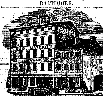
Mathiot's ay succe War -rooms. No. 25 Gay Street, near Fayette,

THE LARGEST CHAIR AND FURNITURE ESTABLISHM BALTIMORE.