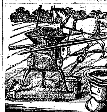
SCOTT'S LITTLE GIANT CORN.

PATENT SELF-SHARPENING. WANKER FRED CUTTERS, manufactured by ABRAHAM & SARGENT, No. 410 Market Street, Philadelphia.