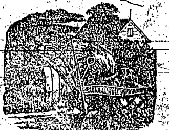
From the Plough, Loom and Anvil. The Various Uses of Manures.

At the suggestion of a subscriber, in our last number we described the various modes of applying guano to the soil. We propose to extend these suggestions to other mineral and artificial manures.