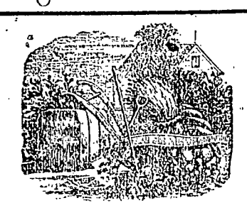
Cost of Manures.