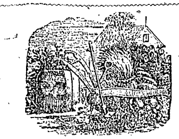
General Agricultural Intelligence.

. Office of the Daily Times, NEW YORK, Aug. 8, 1855.