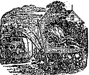
From the Farm Journal. WORK FOR THE MONTH.

FARM.—Clover seed should now be sown before the ground becomes hard. Five or six quarts is about the proper quantity for an acre.