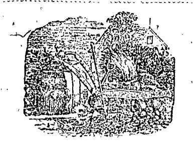
What Shall we Eat?

The following from the New York Trine, contains some useful suggestions the hard times, which are generally