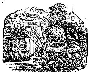
To save Hay and Fodder.

Owing to the extreme drought in many sections, and consequent short pastures farmers have had to commence foddering their stock much sooner than usual.