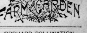
FARM GARDEN. Orchard Pollination. Things the Commercial Fruit Grower Wants to Know.