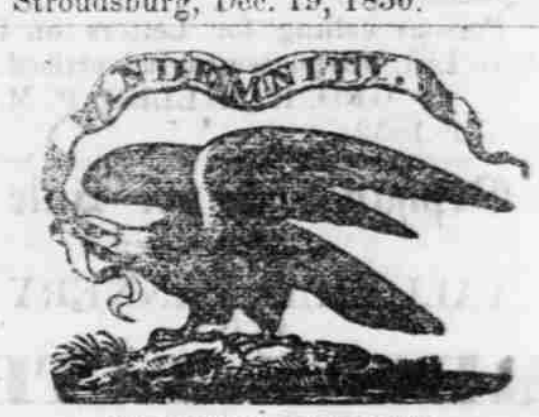
MONROE COUNTY Matual Fire Insurance Comp'y

This powder will secure to cows that healthy and thrifty condition of system, which The testimony in its favor is over- will produce the Milk and Butter, so much whelming. The proprietors are dai y in relished during the summer season, when receipt of letters and certificates, going Cattle go into good Pasture. Their appetite to prove its remarkable efficiency to all will be continually good ; the powder will the general reader, while it conveys intelli- cases of worms, both in children and a- would otherwise soon lack and consequently supply them with that nutriment, which they gence of what is going forward in the world du ts. The relief given, and the immedi- fall off both in quantity and quality of Mill ate improvement of health which follows and Butter as soon as the hot summer sea- received and offer for sale at our store in its use, has called the attention of physi- son advances and pasture becomes stale,cians to this artic'e, and they freely re- Any Farmer or Dairyman, who will feed this READY-MADE owder regularly to his Cows will find them in a continued good condition, summer or winter. For this purpose a table spoonful sa the powder should be given two or 3 time of