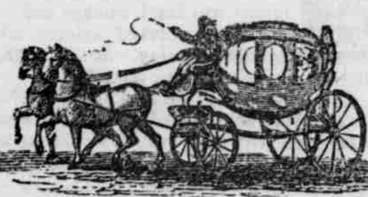
Mail Line of Stages.