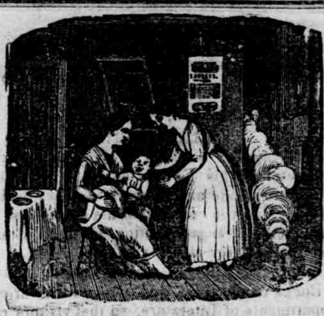
Its Works Praise It.

BLANK MORTGAGES For sale at this Office.