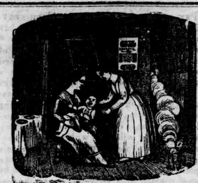
Its Works Praise It.

BLANK MORTGAGES For sale at this Office.