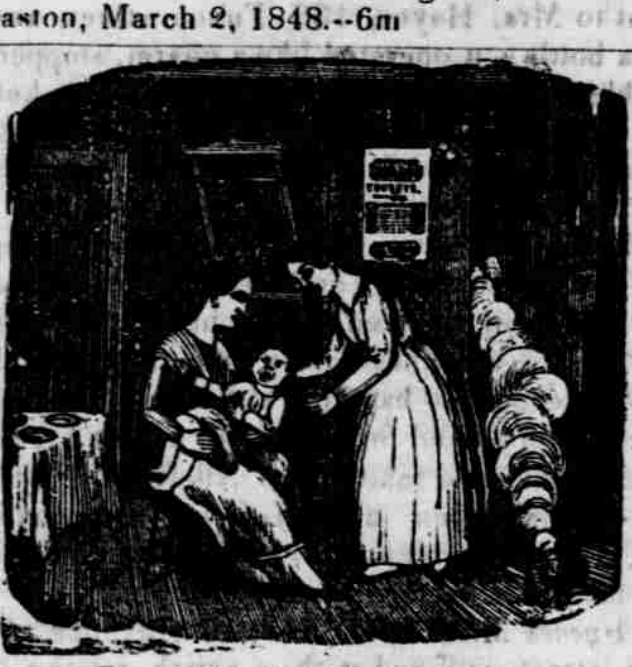
Its Works Praise It. Burns, Scalds, and all kinds of Inflamed Sores

Tousey's Universal Ointment, is the most complete Burn Antidote ever know. It instantly (and as if by Magic) stops pains of the most desperate Burns and Scalds. For old Sores, Bruises, Cuts, The Likenesses taken and beautifully colored Sprains, &c., on man of beast, it the best application that can be made. Thousands have tried, and thousands praise if. It is the most perfect mend it. Every family should be provided with