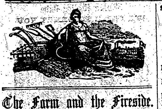
The Farm and the Fireside.