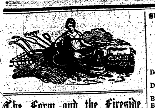
The Farm and the Fireside.