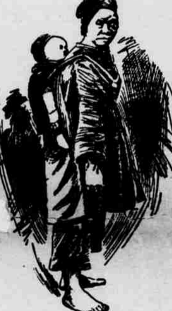
CHINESE MOTHER AND BABY.