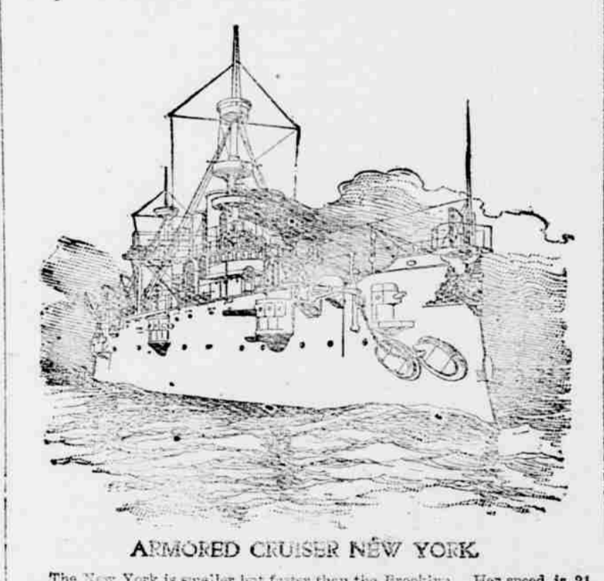
ARMORED CRUISER NEW YORK.

Commander Sampson, of the fleet before Havana, determined to see for himself. On the 27th of April, he steamed to Matanzas in the flag ship New York.