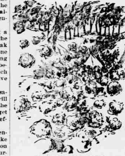
COVERING UP THE TENT.

storm was coming up, and so every thing was made safe and snug around the tent before the party went to bed. Sometime in the night both the boy woke up quite suddenly.