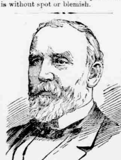
REPUBLICAN CANDIDATE FOR HUDGE OF THE

et and the times get worse, don't In the many positions of grave reunder your tongue that you helped himself worthy of the confidence imto bring about the times you are liv posed in him. As a soldier he was ing under. You will have the satis- obedient and brave; as an officer, gal faction of living on the soup of the lant and fearless; as a legislator, conscientious and w.se. His private life ously fights, and it is always victor may become the very strongest of the