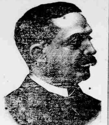
HON. MATTHEW STANLEY QUAY