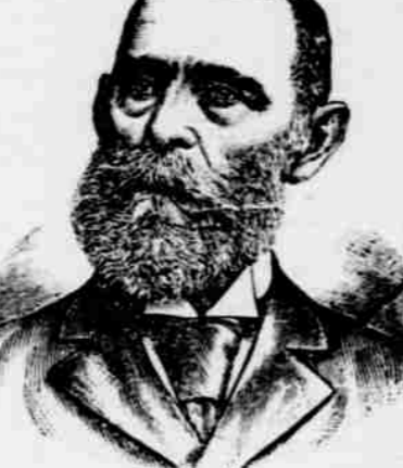
Gen. David M. Murtrie Gregg.