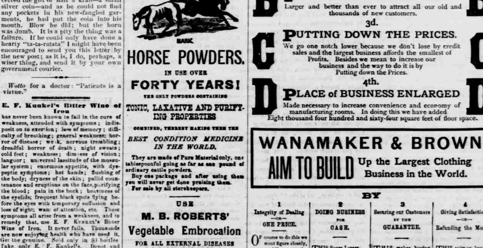
FOR ALL EXTERNAL DISEASES .......

Sumatra, are almost equally remark-able. The palm tree gives syrup, sugar and intoxicating liquor, as well as fruit, cordage, timber, thatch, clothing and A funit fine of the term quarky of the water P. S.-We still our goods at pross that do not require any drumming on the road. Orders by main will rev deive premat attention. Established 1840. 3-26-19