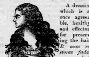
Ayer's Hair Vigor