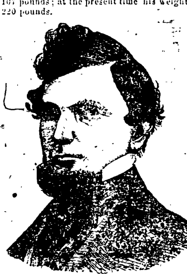
NEW YORK Wednesday, March 30, '61.