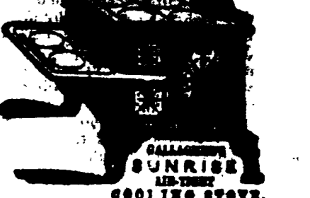
Cook and Parlor Stove.

Use Shriners' BALSAMIC COUGH SYRUP. A FAMILY REMEDY IT HAS NO EQUAL!