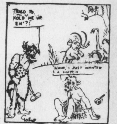
People used to bash in the heads of strangers who jostled them.

they are relatives and love each other so dearly that politeness would be as out of place with them as dress suits at breakfast. Nations are ten times as polite as individuals because they only have one-tenth as much faith in each other. No mere man could use the