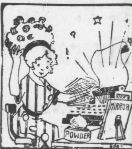
They sometimes spare a moment to typewrite a letter or two.

hour of their employer's valuable time to convince him he is entitled to all the credit of the improvement. Stenographers get from $3 a week to $10,000 a year and earn less and more than this. A poor stenographer is dear at $3 a week, while there is always a waiting list of eager employers for the $150 a month stenographer.