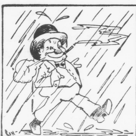
The optimist sees only the bright side of things.

Thus optimism is profitable, but not always to the optimist. However,