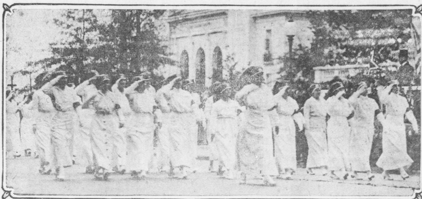
Members of the American Red Cross society marching before President Wilson at the dedication of a Red Cross memorial for the women of the civil war at Washington. These women are all prepared to take up work in France.