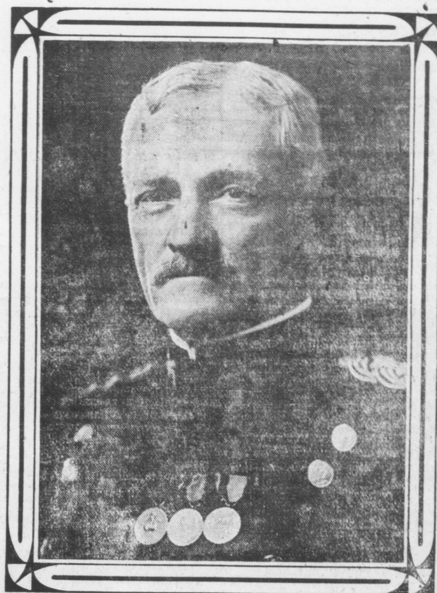
MAJOR GENERAL JOHN J. PERSHING

Washington, May 9.—Orders summarily Major General John J. Pershing, commanding the Southern Department to Washington, have aroused much speculation here. Officials have declined to give any explanation or comment on reports that the general's visit is connected with the subject of selecting a commander for a military expedition to France.