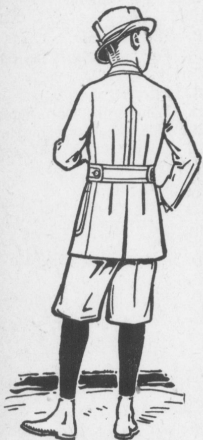
Sampeck Clothes The Standard of America

All beekeepers within easy reach are urgently asked to attend, and heartily invited to cooperate in this movement for better beekeeping in Pennsylvania.