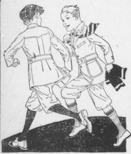
Sampeck Clothes The Standard of America

Comprate gli Abiti SAMPECK per i vostri ragazzi