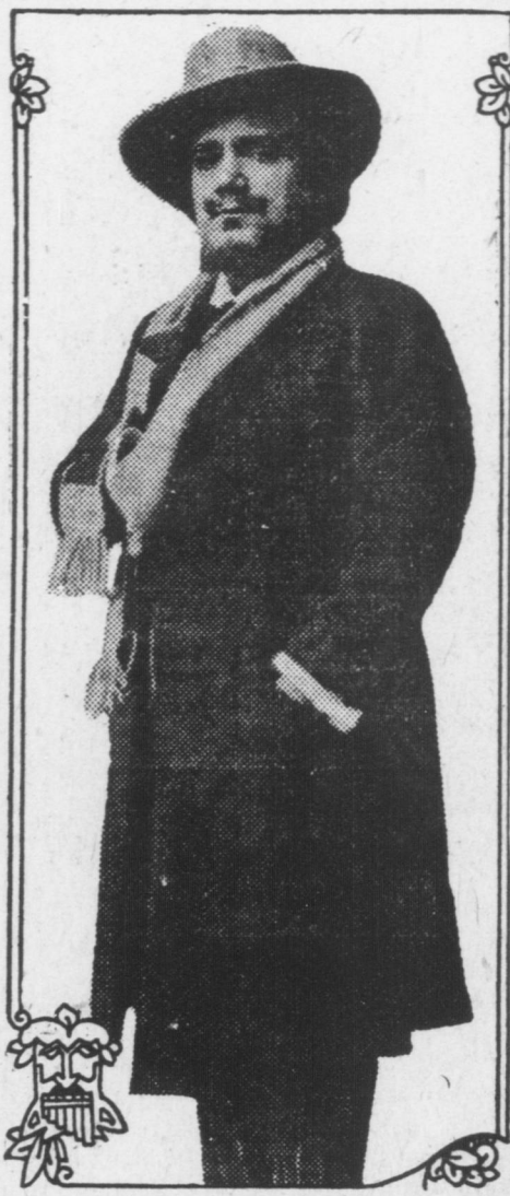
Caruso as Rudolfo in "La Boheme."

Caruso, who sings in Pittsburgh with the Cincinnati Orchestra on Saturday evening, May 5th, at Shriners' Mosque, is a constant target for the camera man. Probably no operatic artist in the world has been so sought after by the professional news photographers. And he must be in a very bad humor, something which seldom occurs, not to