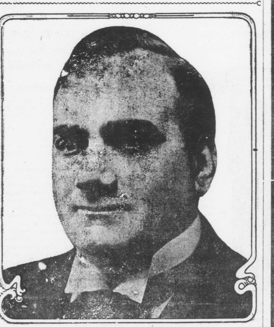
ENRICO CARUSO, KING OF TENORS.